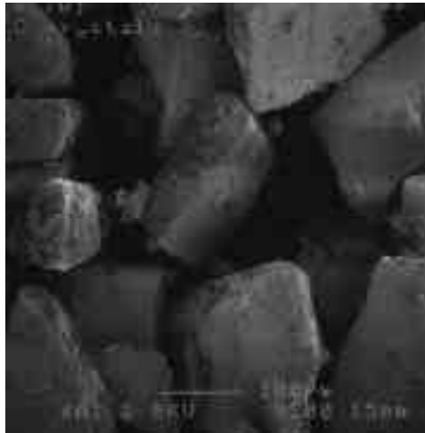
200x microscopic view of a USP ascorbic acid. Notice the rock-like appearance.

optimal life expression can only be sustained when we are fully functional and all necessary tasks are being performed. Your body cannot be healthy if it is missing a vital nutrient or if that nutrient has been damaged. Any disintegration of the delicate vitamin complex disables and debilitates the nutrients and renders it useless. “Devitalizing the vitamin” begins immediately upon